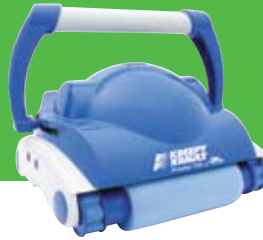
Kreepy Krauly® Prowler® 720 Robotic Pool Cleaner