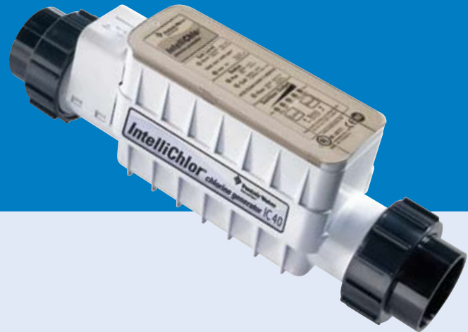
IntelliChlor® Automatic Chlorine Generator

Using only natural table salt, the IntelliChlor® automatic chlorine generator creates pure chlorine in your pool and eliminates the need to buy, store, and add harsh chlorine products manually. In effect, fewer resources are used in the production, packaging, and transportation of these chemical compounds.