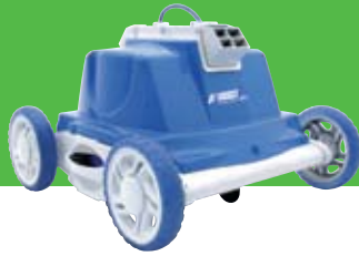
Kreepy Krauly® Prowler® 710 Robotic Pool Cleaner

The powerful Kreepy Krauly® Legend® II pressure-side pool cleaner and Kreepy Krauly® Prowler® robotic cleaners provide highly energy-efficient cleaning performance.