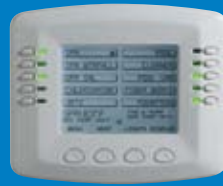
IntelliTouch® Indoor Control Panel

Pentair control systems can optimize energy use and equipment performance by automating and synchronizing equipment scheduling. They prevent problems and waste so you don't have to rely on your memory or limited time clocks to operate or turn off equipment.