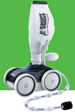
Kreepy Krauly® Legend® II Automatic Pool Cleaner