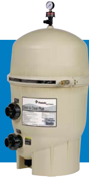
Clean & Clear® Plus Cartridge Filters

Water flows very efficiently through the Clean & Clear® Plus cartridge filters, often allowing the use of smaller pumps or lower pump speeds to minimize energy use. And when you rinse cartridges rather than backwash, you can significantly reduce water use, too.