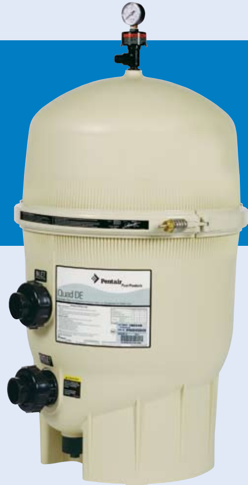
Quad D.E. ® Filter