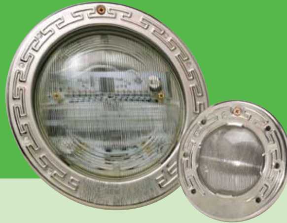
IntelliBrite® 5g LED Pool Lights

IntelliBrite® 5g LED (Light Emitting Diode) pool lights and IntelliBrite® LED spa lights are the most energy-efficient pool and spa lighting option available. Plus, they can last longer, minimizing replacement cost and disposal.