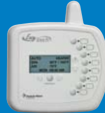
EasyTouch® Automated Controls