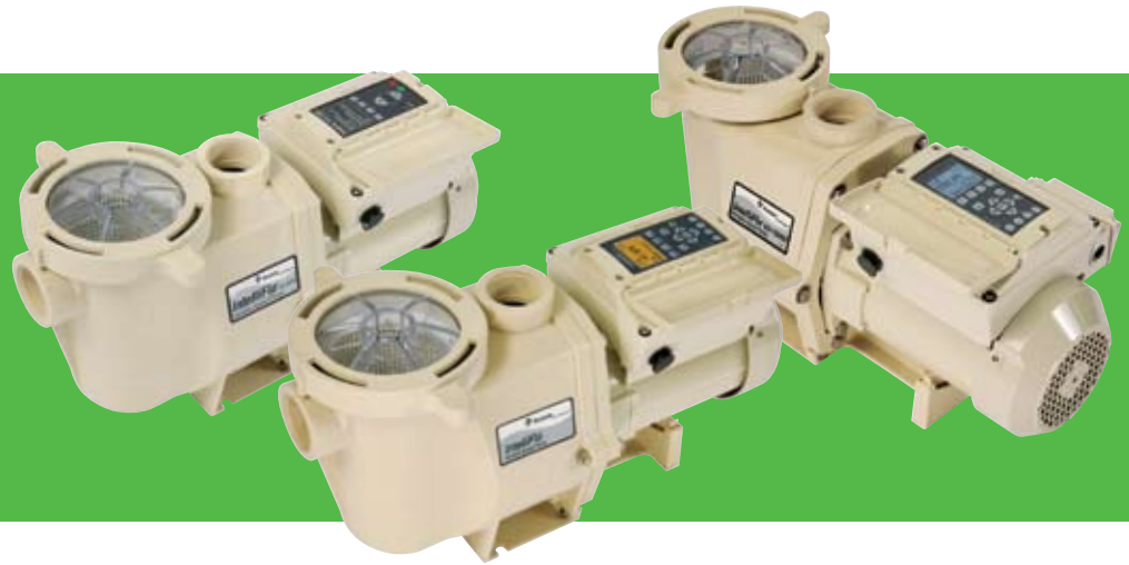
IntelliFlo® vs-3050 Variable Speed Pump

Standard pool pumps can consume as much energy as all other home appliances combined—often costing more than $1,000 per year! IntelliFlo® pumps can cut energy use up to 90%, generally saving $620 to $1,360* in utility costs annually—more where rates are higher than average.