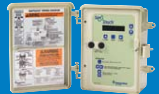
SunTouch® Automated Controls