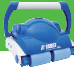
Kreepy Krauly® Prowler® 730 Robotic Pool Cleaner